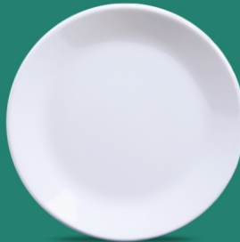
Dinner Plate - 11"