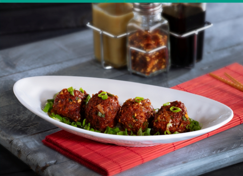
Oval Platter 9.75" x 5.25"