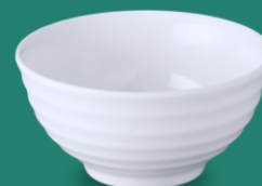
Soup Bowl - 4.25"