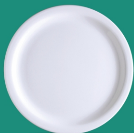
Dinner Plate - 11"