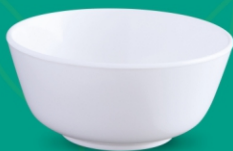
Soup Bowl 4.25"