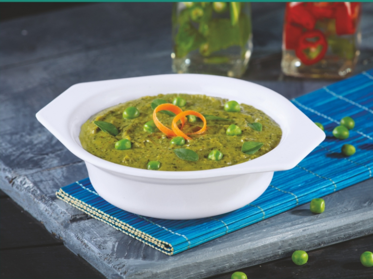
Subji Bowl 7" x 6"