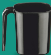
Sq Milk Mug