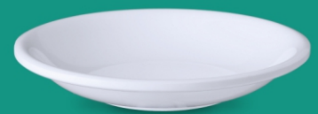
Snack Plate-6", 5"