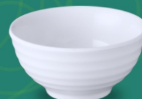
Veg Bowl - 3.75"