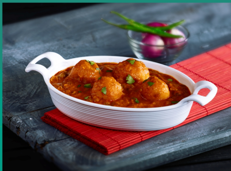
Serving Bowl with Handle 8.5" x 5"