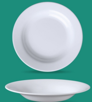
Rim Soup Plate-10", 8", 6"