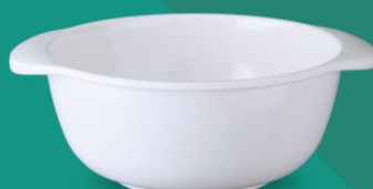
Deep Serving Bowl-7.25"