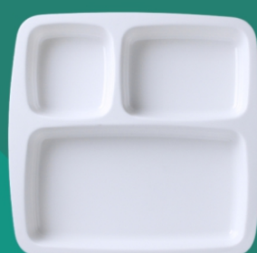
3 Partition Plate