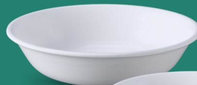
Serving Bowl 8.25", 7.25", 6.25"