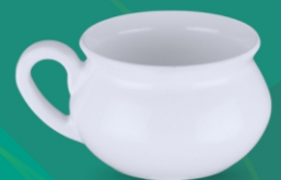
Soup Mug with Handle