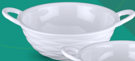
Kadhai- 8", 7"