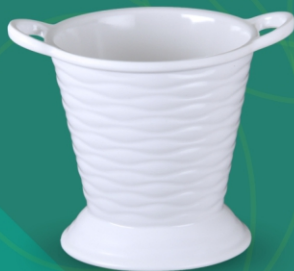
Bucket (Balti) 6"