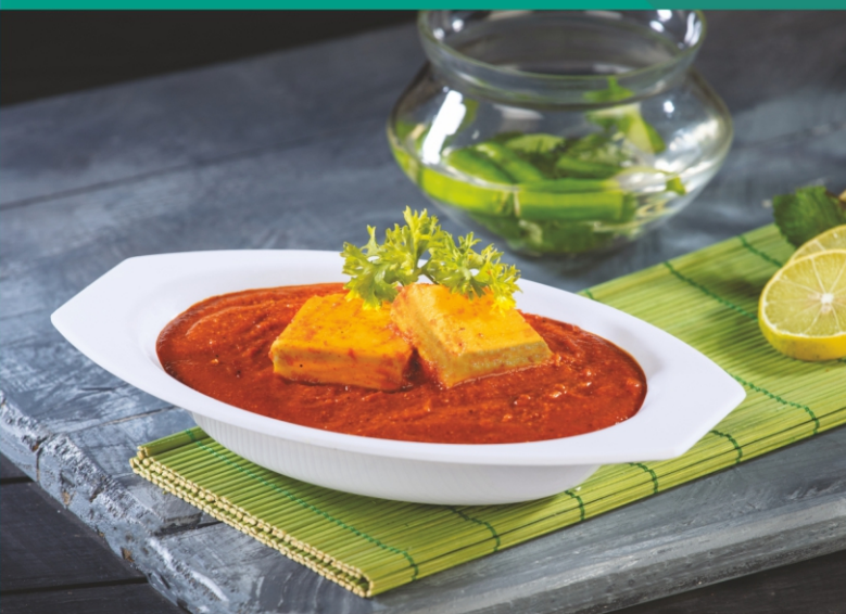
Oval Vej. Bowl 8" x 5"