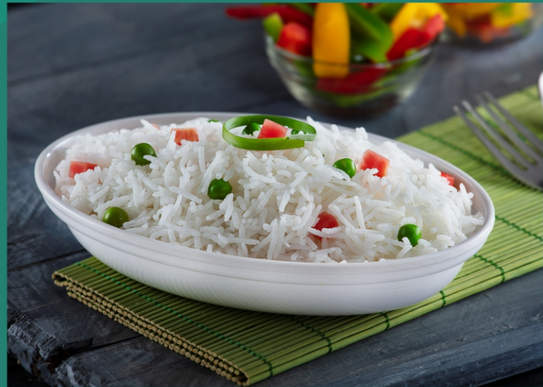
Oval Patti Rice/veg. Bowl 7.25" x 5"