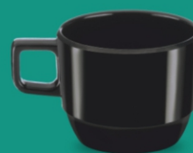
Frio Cup Small