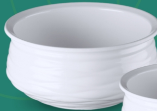
Handi- 6", 5", 3.5"