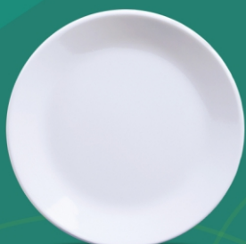
Dinner Plate - 11"