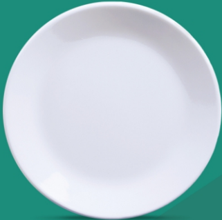
Buffet Plate - 13"