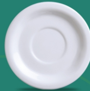
Saucer - 6"