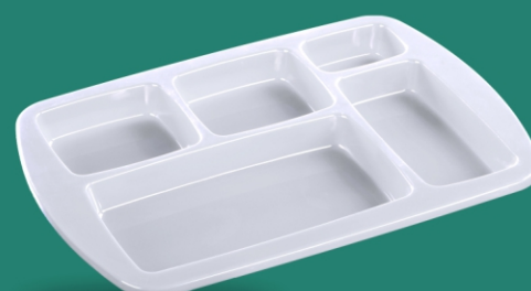
5 Partition Plate