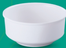
Palam Soup Bowl 4.25"