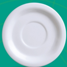
Saucer 6" X 6"