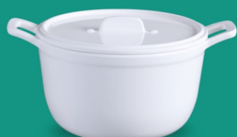
Casserole - 2000 ml.